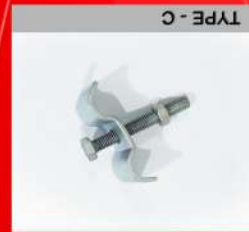
TYPE - C