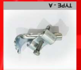
TYPE - A