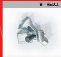
TYPE - B